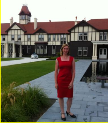
Me in front of Government House